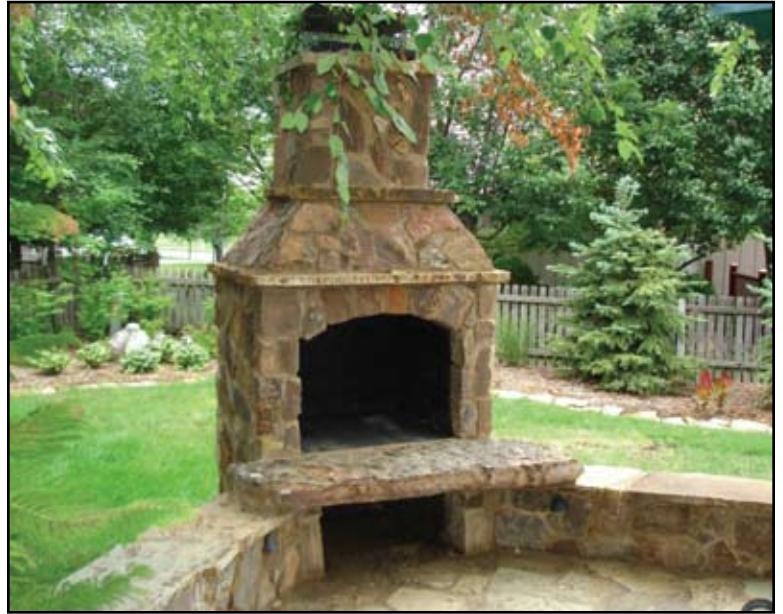
(Above) Outdoor Fireplace using Trailhead Natural Thin Veneer . Designer: Maverick Landscaping, Stillwell, KS. (913)915-2905 . More from this designer at www.mavericklandscaping.com .

With this landscape renaissance, comes the need for a designer's versatility in all the above, plus plants, trees, retaining walls and more. But especially Outdoor Fireplaces. Why? Because these beautiful creations are the focal point for many new "Outdoor living spaces". Plus, by adding a fireplace, you extend the outdoor seasons.