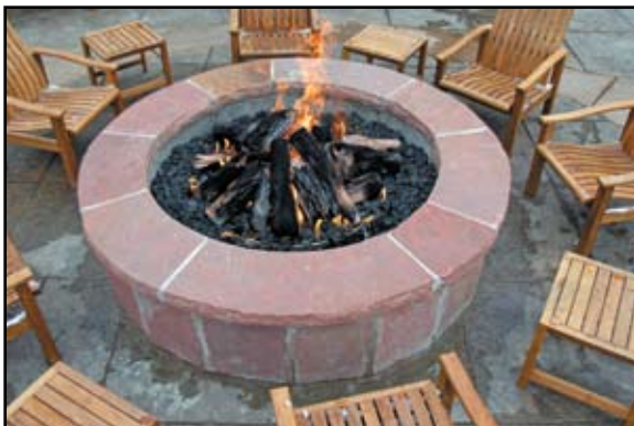
(Above) Fire Pit shown using Bluestone Flagstone.

Chimineas took off in 2005/2006. Manufactured Fire Pits are the craze of 2007. But for the true outdoorsman, custom made, hand-crafted fire pits are safer, more functional and have the natural beauty that fit perfectly in any space. Both 42" Round & Square pits (shown here) are available only at Sturgis.