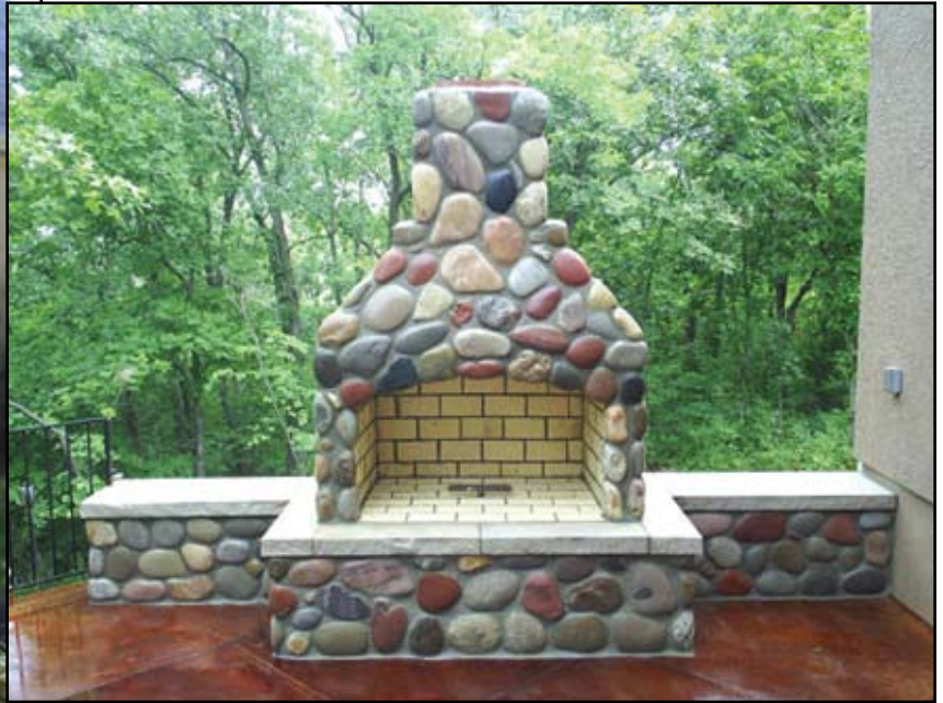
(Left) Outdoor Fireplace using Rustic Split Face Natural Thin Veneer with Hillsboro Limestone hearth. (Above) Blue River Natural Thin Veneer with Indiana Limestone wall cap. Designer (both): KC Stoneworks, (913)231-4847

In accordance with today's trends, landscape designers are receiving fewer requests for an English or Japanese Garden, or a certain look they've seen on their distant travels. Instead, they are asking how they can best use the existing "natural" landscaping features and blend in with nature. That means that the height, color and texture of the fireplace is as important as where it's placed in the yard or patio. "Outdoor Living" is about natural stone and real wood. Pre-fabricated materials do not blend in harmony with nature. Therefore they do not have a place in these created retreats and somewhat defeat the purpose of a "Backyard Escape".