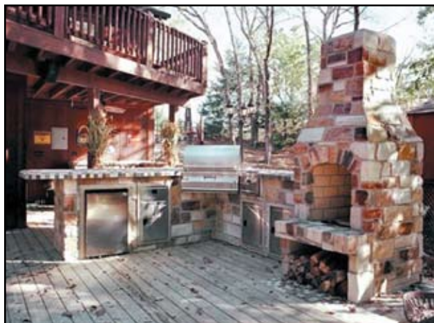
(Above) Outdoor Fireplace using Westcliffe Natural Thin Veneer (Robinson Rock) . Designer: Hisco Design/Build of Merriam, KS. (913)362-8862

Visualize the family sitting around the fireplace pictured above in late October. You're all wrapped in blankets next to the fire roasting marshmallows to make s'mores. The ambiance of the fire relaxes you from the day's trials. You can now have these experiences any night you choose, right in your own backyard. This sounds much better than watching reruns on television!